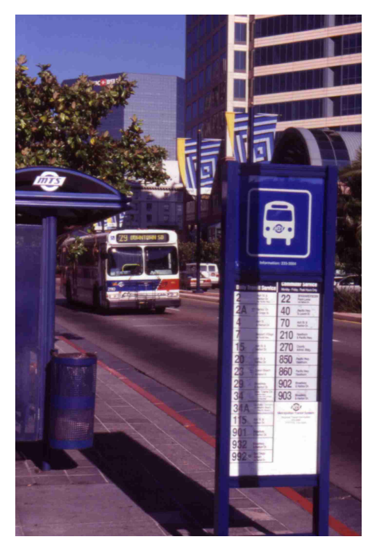
A bus stop in downtown San Diego features an information kiosk as well as a shelter for waiting patrons. Community maps, schedules, and public telephones all reinforce a commitment to transit use.

Bus stops need to respond to passenger design criteria to ensure access and convenience to as many people as possible. All bus stops must be accessible by physically challenged persons. These requirements pertain not only at the actual stop but include efforts to provide circulation connections to adjacent neighborhoods.