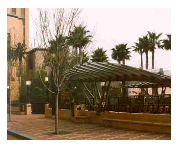
This bus shelter is part of a transit center in Los Angeles which links railways, commute trains, buses and the city's subway.