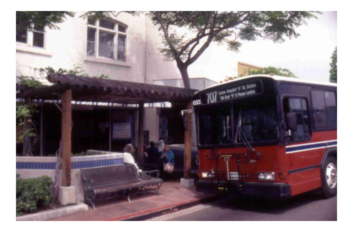
The development of this bus stop in Chula Vista, California, was closely integrated with the revitalization of the surrounding retail district.