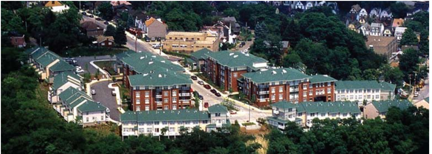
OAK HILL, Pittsburgh, PA