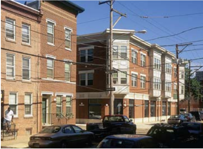
MARTIN LUTHER KING JR. PLAZA, Philadelphia, PA