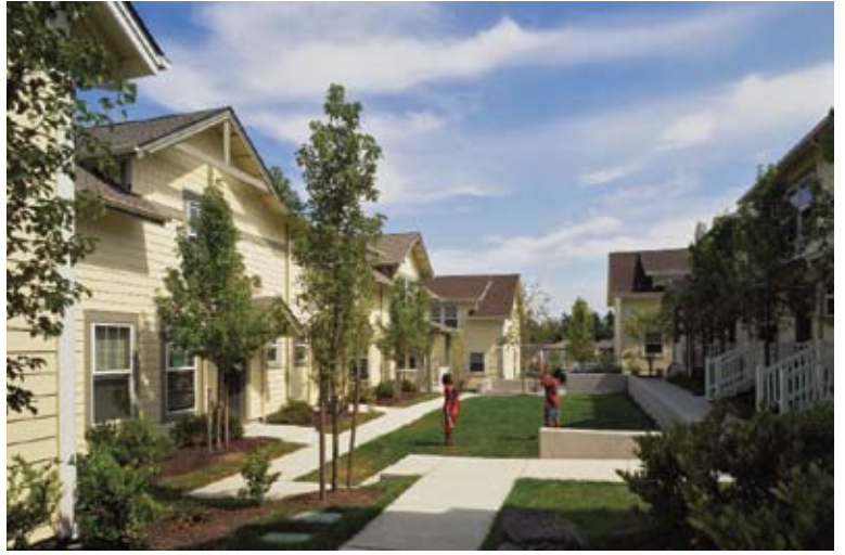
SALISHAN NEIGHBORHOOD, Tacoma, WA