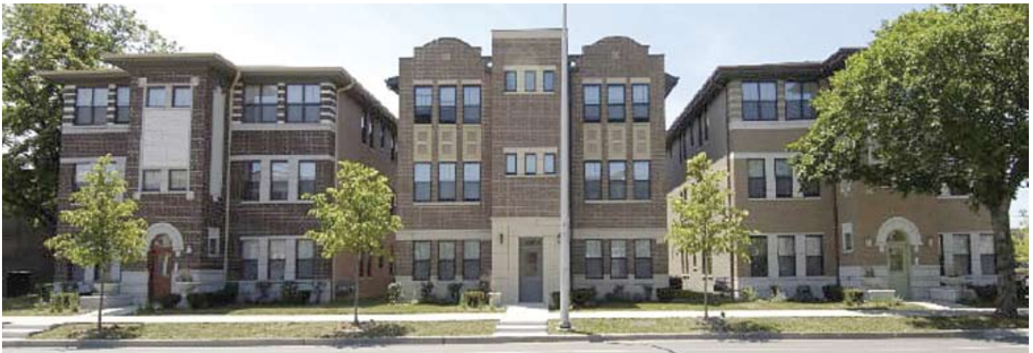
OAKWOOD SHORES, Chicago, IL