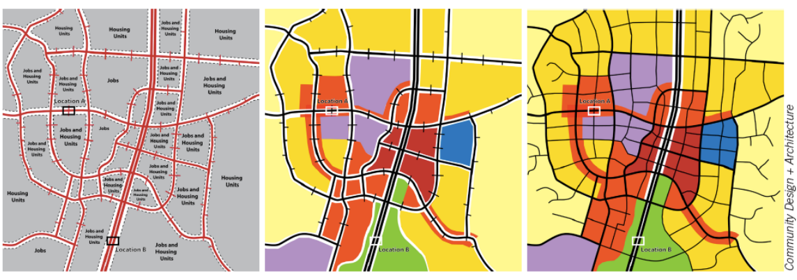
Conventional Scope of a Transportation Plan Conventional Scope of a Comprehensive Plan Conventional Scope of a Place Plan