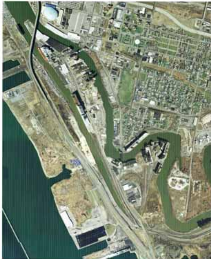
BUFFALO, NEW YORK