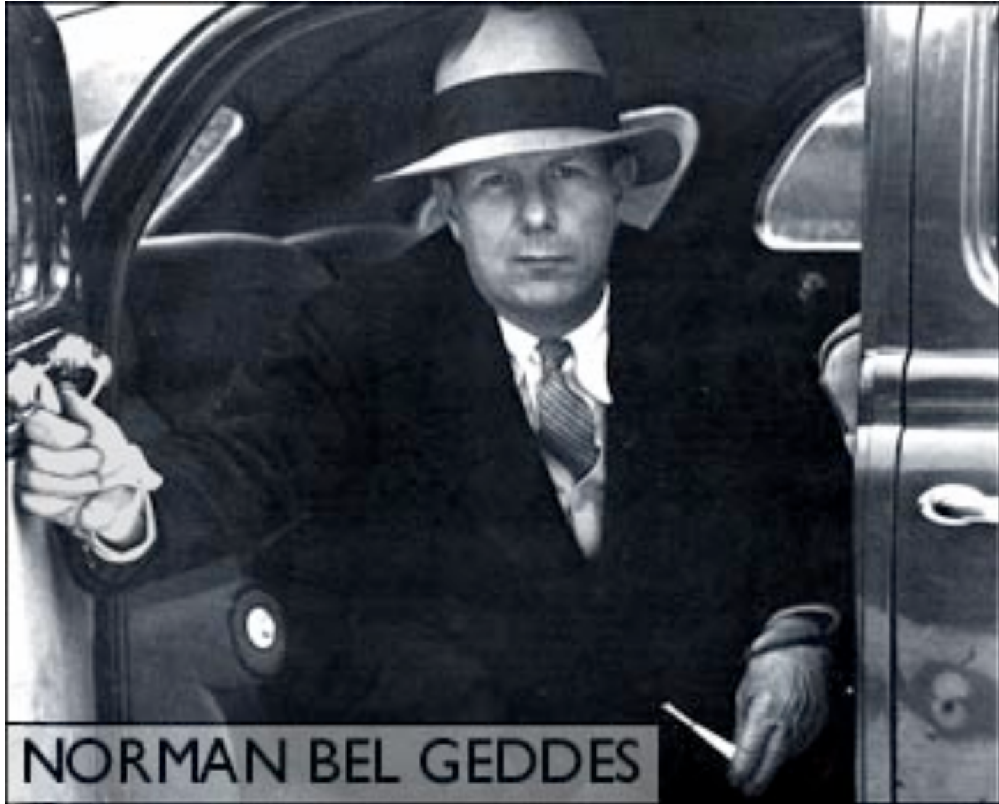
NORMAN BEL GEDDES