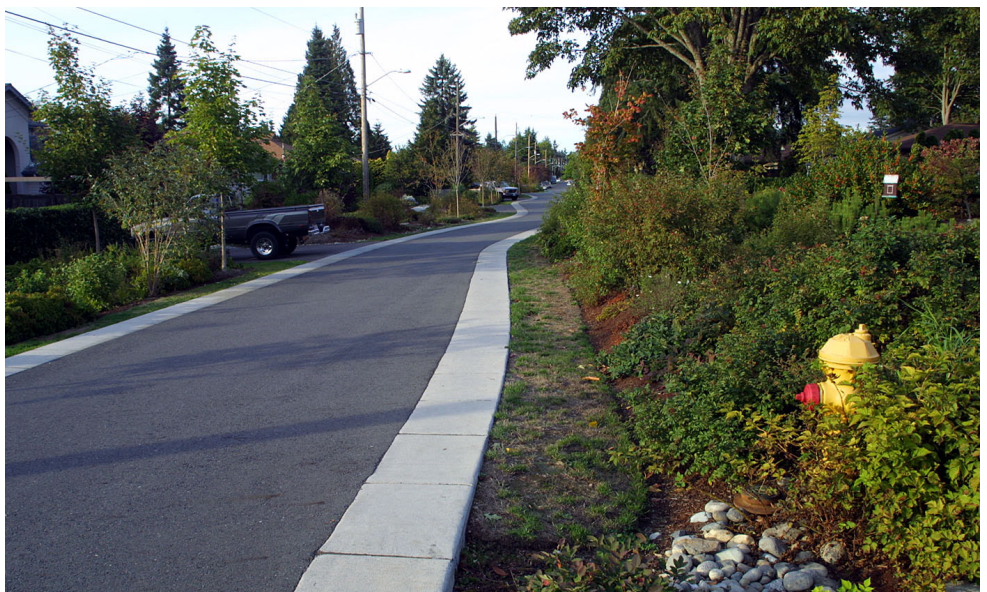
Woonerf in Seattle demonstrating how narrow streets create great places while accomodating emergency equipment access.

of the developed areas of the country, including both the more compact towns and villages from before World War II and the broad street automobile friendly suburbs of the 1950s and 1960s, were constructed with very little if any legal input from the fire service. The author still often hears firefighters say that they will (can) deal with whatever conditions are dished out to them. These statements are made because the firefighters do not see that they can impact what is constructed or where it is constructed. These comments are from firefighters in a department that has adopted a consensus fire code since the 1973 edition of the UFC. A good summary of the nation's fire and life safety progress through the late 1980s can be gleaned from two excellent sources, "America Burning" and "America Burning Revisited," which are available on-line from the U.S. Fire Administration at http://www.usfa.dhs.gov/downloads/pdf/publications/fa-264.pdf and http://www.usfa.dhs.gov/downloads/pdf/publications/5-0133-508.pdf respectively. This background is important for those outside the fire service who would understand the