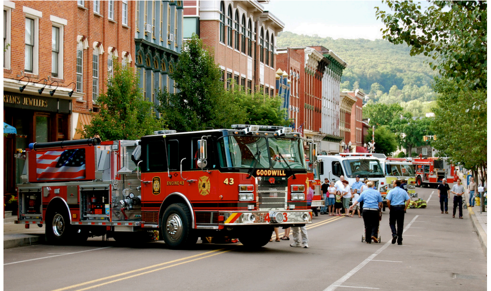
Fire truck meet and greet, Danville, PA.

This paper is presented as an effort to 1) give the lay reader a reasonable level of understanding as it relates to the nature and operation of the fire service in the United States, 2) describe the current state of the street design dialogue initiated in 2007, 3) suggest some potential avenues for continuing and expanding the dialogue that began in 2007, and finally 4) to suggest some avenues for effective communication to both urban designers and fire service professionals that might help bridge the chasm that often exists when urban design goals appear to clash with the need for maneuvering emergency vehicles within and around neighborhoods and communities.