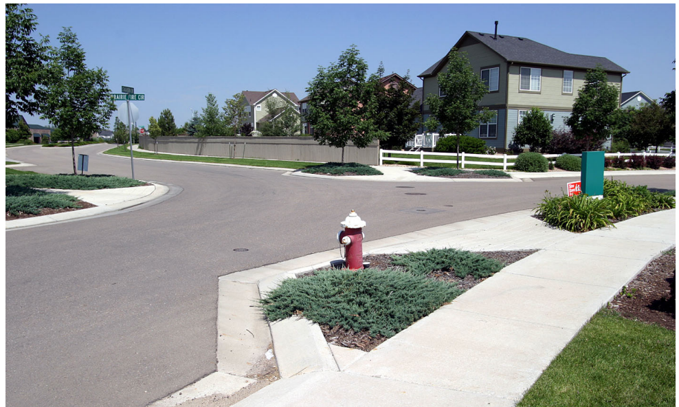
A narrow street with mountable curbs in Longmont, Colorado.

In 1796, New Orleans (then a Spanish Colony) adopted a law prohibiting wood roofs. 5 Just as Boston established the first paid fire department in the United States, the board of selectmen in Boston also adopted one of the first fire safety ordinances in North America in 1631 when it prohibited wooden chimneys and thatch roofs following a disastrous fire. 6 As with these two laws, the development of fire safety legislation has been almost exclusively a reactionary process throughout the history of the United States and likely most of the world.